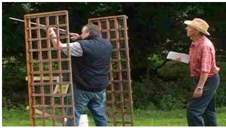
Carers Aiming to Raise Funds