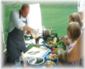
Community Chef in Action

RVA interacts with large numbers of people and organisations across Rother. These range from the smallest community group, and village action group to large public sector bodies. At the last count there were over 500 community groups in Rother. RVA works in a number of different ways ranging from representation of community sector viewpoints, researching needs and helping shape policy and strategy, to the facilitation of partnerships, leadership of community projects and advocacy for better services.